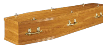
Solid wood £1100