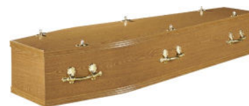
Foil wrapped chipped board £475