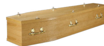
Wood veneer £525