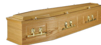
Wood veneer, panelled sides AND raised lid £750