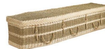
Willow, Sea Grass or Bespoke From £850

All available in a range of woods and stains.