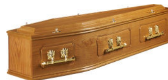
Solid wood, panelled sides AND raised lid £1325